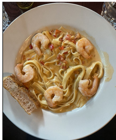
Diablo Shrimp Pasta